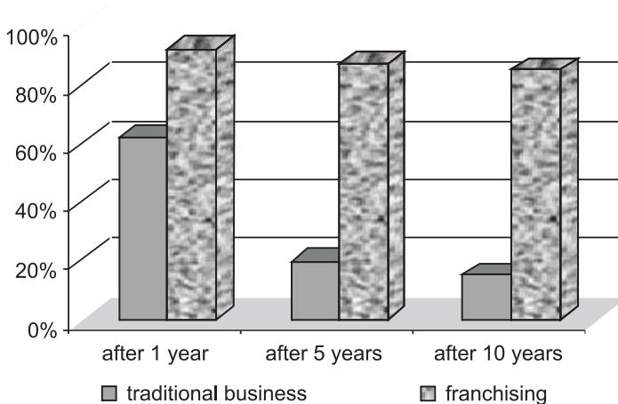
Figure 2. Comparison of the firms operated on franchising terms and by traditional methods

Besides that, a franchiser usually has a ready-made standardized business plan that is to be followed by a franchisee. This business plan specifies the size of necessary investments, the expected sales, the estimated payback periods, the sequence of franchisee's actions when launching its business etc. It is clear that a franchiser cannot guarantee that actual business figures of a franchisee will not be lower than the ones stipulated in the business plan, as the franchisee's success depends, above all, on its own effort. However, the franchiser's access to the statistical data on the franchisee's operation gives one all the grounds to say that the actual business figures will comply with the expected ones.